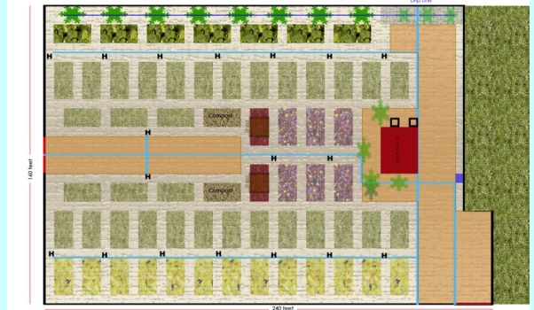
Plot Map for the Garden!

Garden plots are ready, Come to the meeting and get ready to plant!