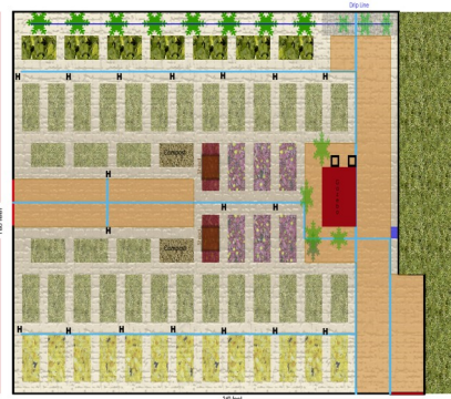
Plot Map for the Garden!